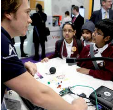
January saw the launch of a partnership to distribute thousands of free Raspberry Pi computers, seen here being demonstrated on the Cambridge Assessment stand at the 2013 BETT show

During this year Cambridge International Examinations was invited by the Government of Macedonia to contribute to their plans to enhance national provision for resources, standards and teaching and learning in mathematics and science. It expects to start on this in the latter half of 2013, working alongside Cambridge University Press and the Macedonian Bureau for Development of Education.