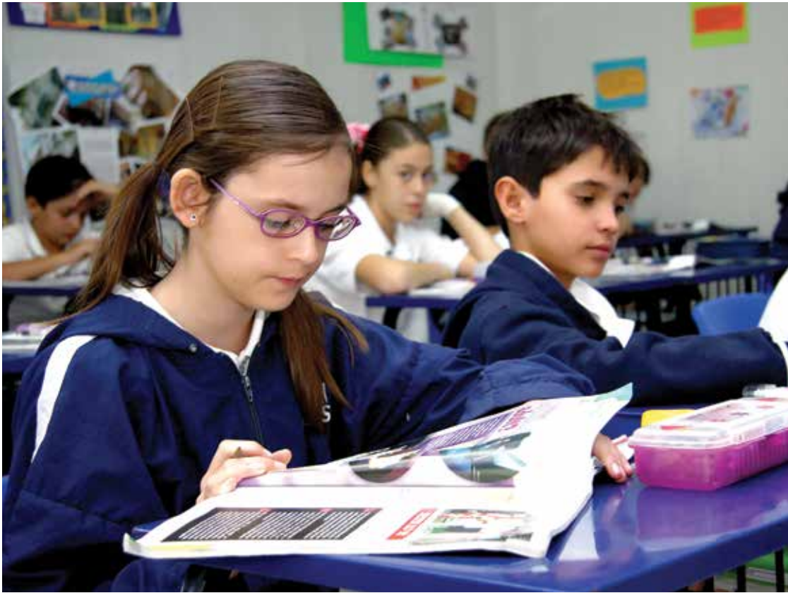
Supporting worldwide delivery of examinations: Students at the International School of Querétaro, Mexico

In Malaysia, a programme for the Council of Trust for the Indigenous Peoples (commonly abbreviated as MARA) is using the Cambridge IGCSE to implement a bilingual dual-certification programme at secondary level. We are working with the Council to help integrate Cambridge programmes into the Malaysian curriculum and to train teachers. We have an important relationship with MARA, a government agency which promotes educational and economic opportunity for Malays and other indigenous peoples, especially in rural areas.